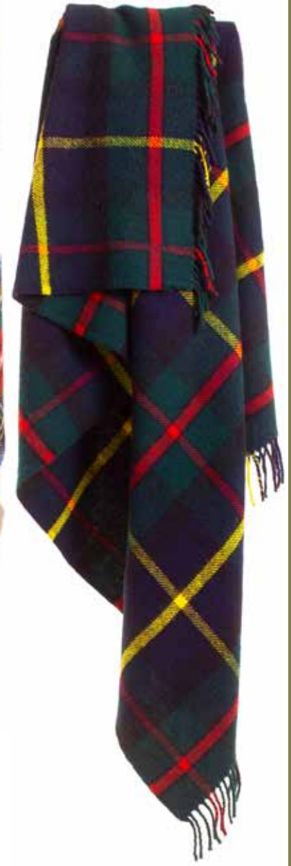
Royal Stewart Throw THTA405 Knee Rug THTAK405